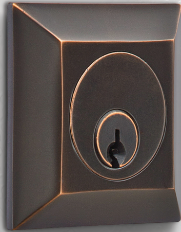
Quincy Deadbolt Finish: Oil Rubbed Bronze (US10B)