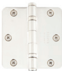
3 1/2" x 3 1/2" Ball Bearing 5/8" Radius Corner