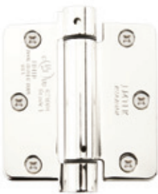
3 1/2" x 3 1/2" Spring Hinge 1/4" Radius Corner