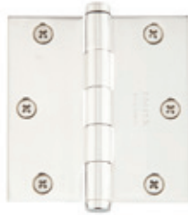
3 1/2" x 3 1/2" Residential Duty Square Corner