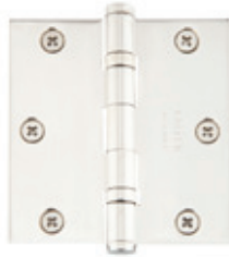
3 1/2" x 3 1/2" Ball Bearing Square Corner