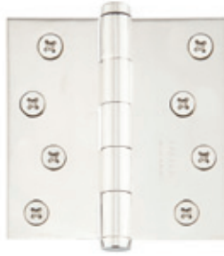
4" x 4" Residential Duty Square Corner