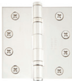
4" x 4" Ball Bearing Square Corner