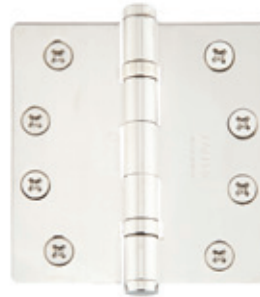
4 1/2" x 4 1/2" Ball Bearing 1/4" Radius Corner