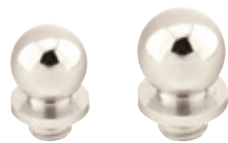
Ball Tip for 3 1/2" Hinges Ball Tip for 4 1/2" Hinges