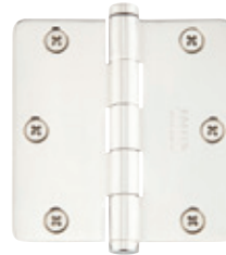
3 1/2" x 3 1/2" Residential Duty 1/4" Radius Corner