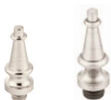
Steeple Tip for 3 1/2" Hinges Steeple Tip for 4" Hinges