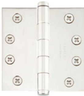
4 1/2" x 4 1/2" Heavy Duty Square Corner