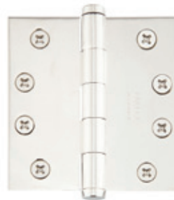
4" x 4" Heavy Duty Square Corner