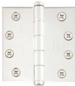
4 1/2" x 4 1/2" Heavy Duty Square Corner