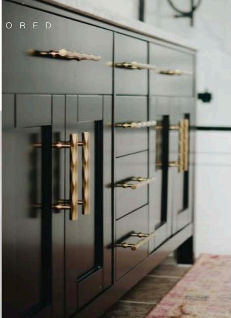
Left: Emtek Tribeca cabinet pulls in satin brass finish; Below: Emtek Select T-Bar knurled door lever with urban modern rosette in satin brass/flat black split finish; Bottom: Emtek Select knobs with conical stems in knurled, and straight knurled.