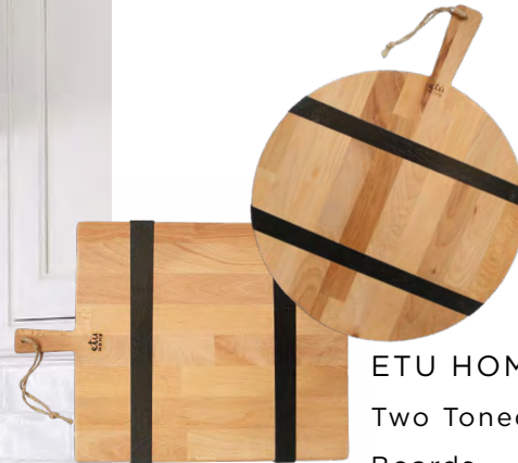
ETU HOME Two Toned Chopping Boards, Brooke & Lou