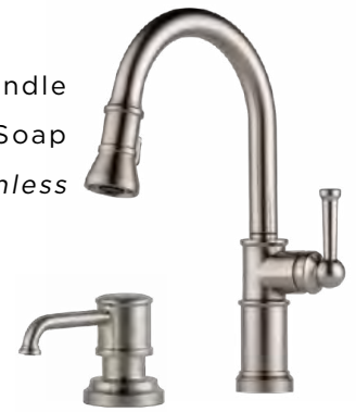
BRIZO Artesso Single Handle Pull-Down Kitchen Faucet, Soap Pump in Stainless