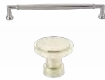
EMTEK Westwood Collection cabinetry and appliance pulls in Satin Nickel