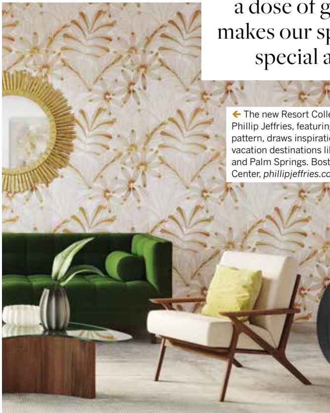
➤ The new Resort Collection by Phillip Jeffries, featuring The Grove pattern, draws inspiration from favorite vacation destinations like Palm Beach and Palm Springs. Boston Design Center, phillipjeffries.com

After spending so much time at home, a dose of glamour makes our spaces feel special again.