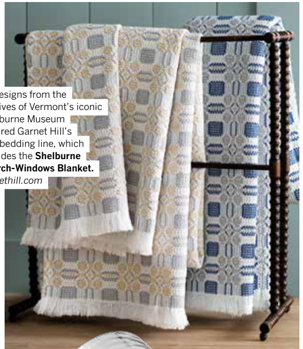
➔ Designs from the archives of Vermont's iconic Shelburne Museum inspired Garnet Hill's new bedding line, which includes the Shelburne Church-Windows Blanket . garnethill.com