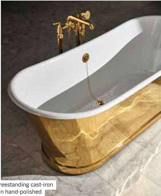
➤ The Emile freestanding cast-iron tub sheathed in hand-polished brass is a decadent work of art for the bathroom. Waterworks, Boston Design Center, waterworks.com