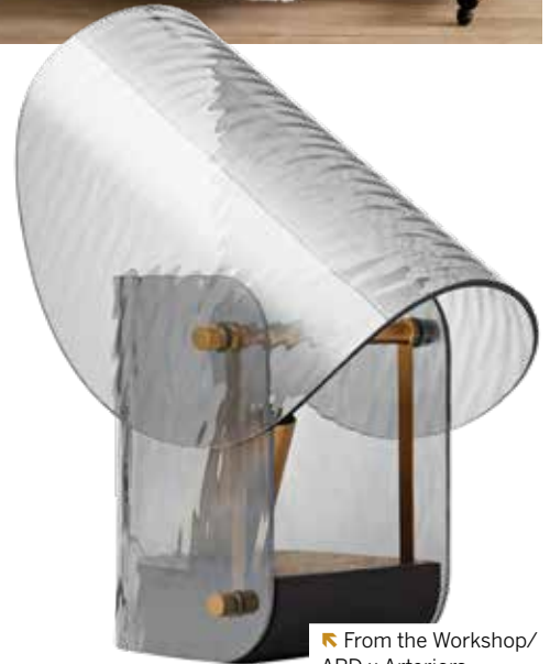
➤ From the Workshop/APD x Arteriors collection, the Bend Accent Lamp is petite in stature but big on style, with its smoky glass and antique brass. Bodega, Nantucket, Mass., bodeganantucket.com

After spending so much time at home, a dose of glamour makes our spaces feel special again.