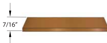
Medium Rosette: #2, Oval, Regular, etc...