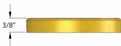
Thin Rosette: #8, Rectangular, Disk, etc...