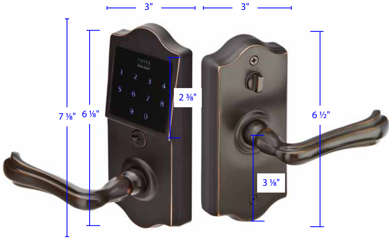
Exterior Projection: 3 1/4"