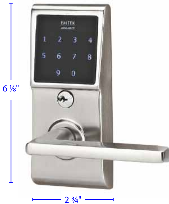
Exterior Projection: 3"