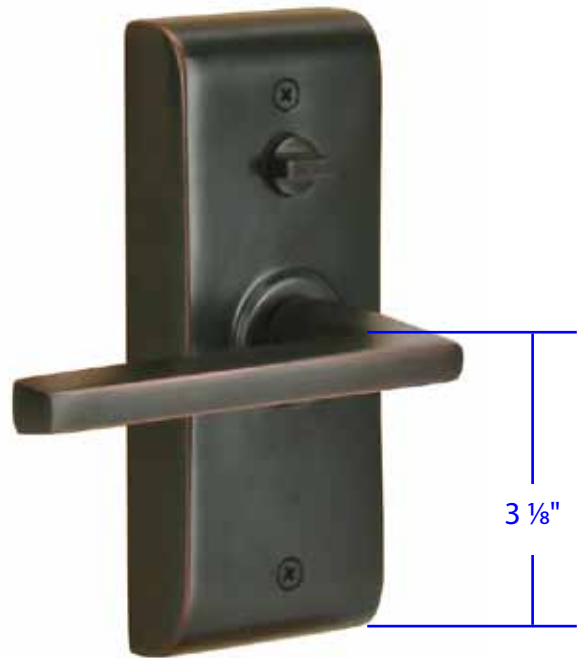
Interior Projection: 3"