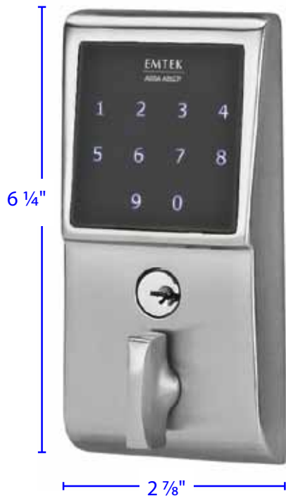
Exterior Projection: 1 1/2"