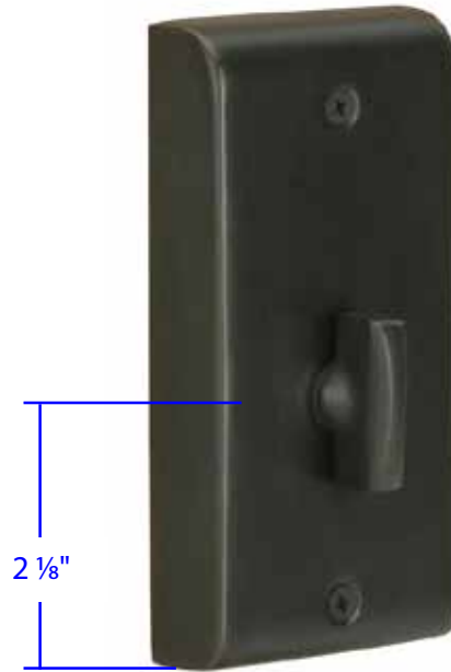
Interior Projection: 1 3/4"